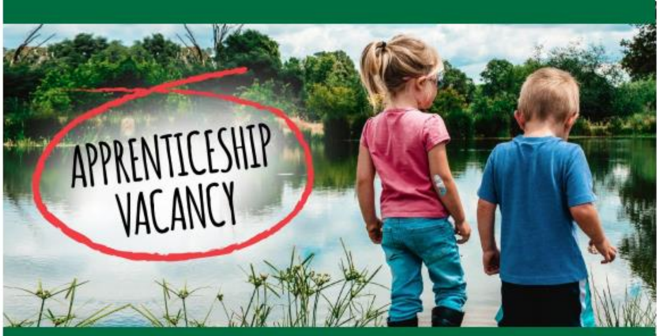
Early Years Practitioner Apprenticeship

In this role you will work in partnership with staff, parents, carers and their children to provide high quality, inclusive, fully integrated early years provision for the children.